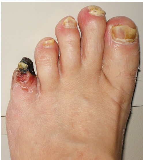
Fig. 3. Photograph of the same patient as in Figure 2 (case 4), in whom an arterial line was later placed into the dorsalis pedis artery. Within 2 days of placement of this arterial catheter, an ipsilateral toe became necrotic.

manipulation, with excellent hyperemic flow to the tissue. Within 5 to 20 minutes of flap perfusion, arterial flow ceased, with thrombus visualized at the anastomotic suture line or site of injury. Change in recipient vessel, donor flap, or surgical technique was not successful. Even use of a surgical anastomotic device to maintain patency by eliminating suture damage at the artery resulted in eventual thrombosis after 2 to 12 hours. The nature of the artery during surgical manipulation was flaccidity despite minimal trauma or cutting back the vessel to fresh tissue. Intraoperative findings that were common to these failed anastomoses were as follows: