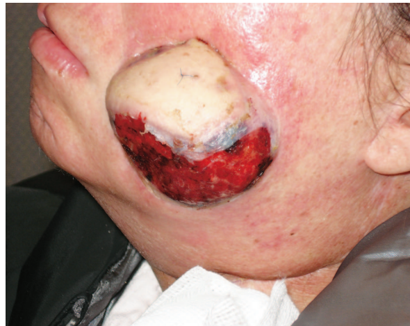
Fig. 1. A 29-year-old woman (the patient in case 3) with a recurrent left cheek carcinoma was left with a through-and-through defect of her cheek after tumor excision. After loss of the first free flap, a second free flap (deep inferior epigastric artery perforator) also experienced significant inflow problems and was left lying on the cheek as inset occluded flow.

A postoperative hematologic workup revealed that the patient was homozygous positive for the C677T polymorphism for the MTHFR gene and had elevated levels of factor VIII activity (214 percent; normal, 50 to 150 percent). She was also found