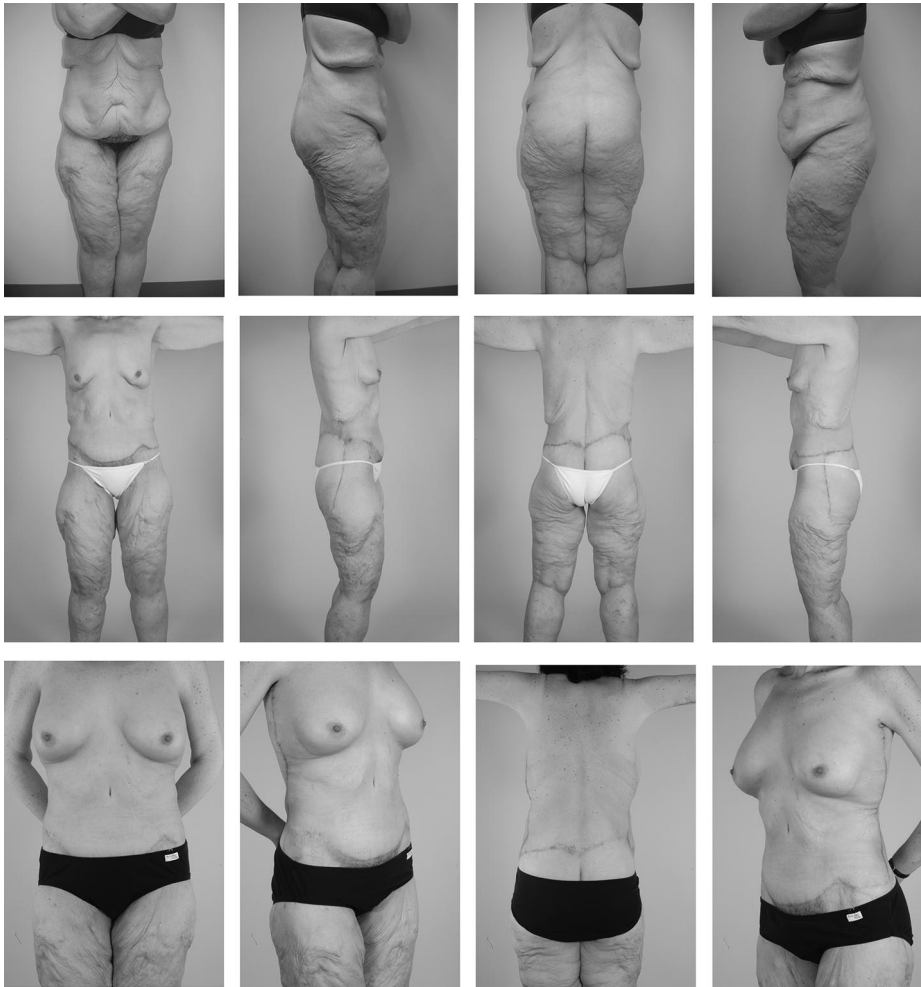
FIGURE 2. Enhanced contour in the thighs after belt lipectomy of patient 2, a 39-year-old female. Body mass index highest, 51, low, 32. Top, pre-operative views. Middle, 12 months postoperatively. Bottom, note 21 months postoperatively that posterior placement of scars is less visible from the front, which is more cosmetic in the view patients usually see.